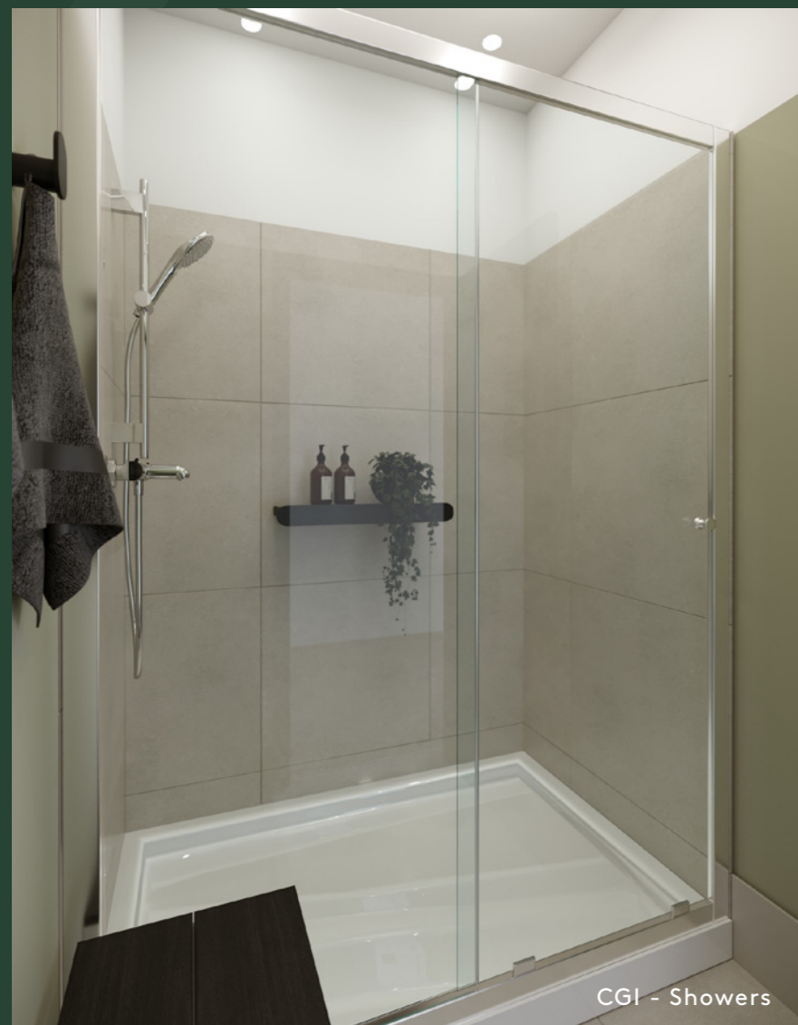
CGI - Showers