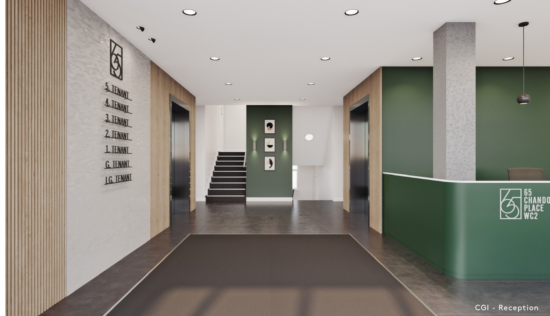
CGI - Reception

65 Chandos Place is a striking building in the heart of Covent Garden, offering 2,173 - 5,658 sq ft of plug and play office space. A newly remodelled manned reception gives an exceptional first impression. A design-led space with modern details, it features two passenger lifts leading to the office floors with excellent natural light.