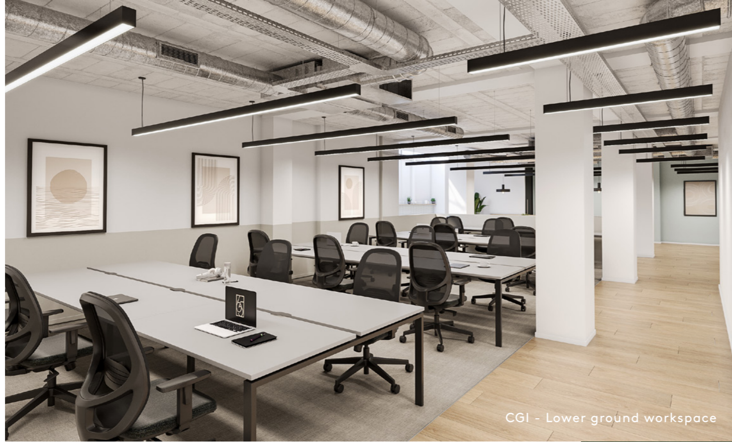
CGI - Lower ground workspace