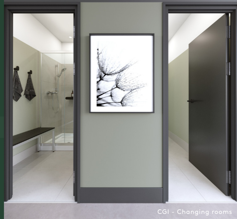
CGI - Changing rooms

The building's brand new end-of-trip facilities ensure that everyone reaches the office feeling refreshed. They include attractive changing rooms and spacious showers, with bike storage and lockers to keep belongings secure and out of mind.