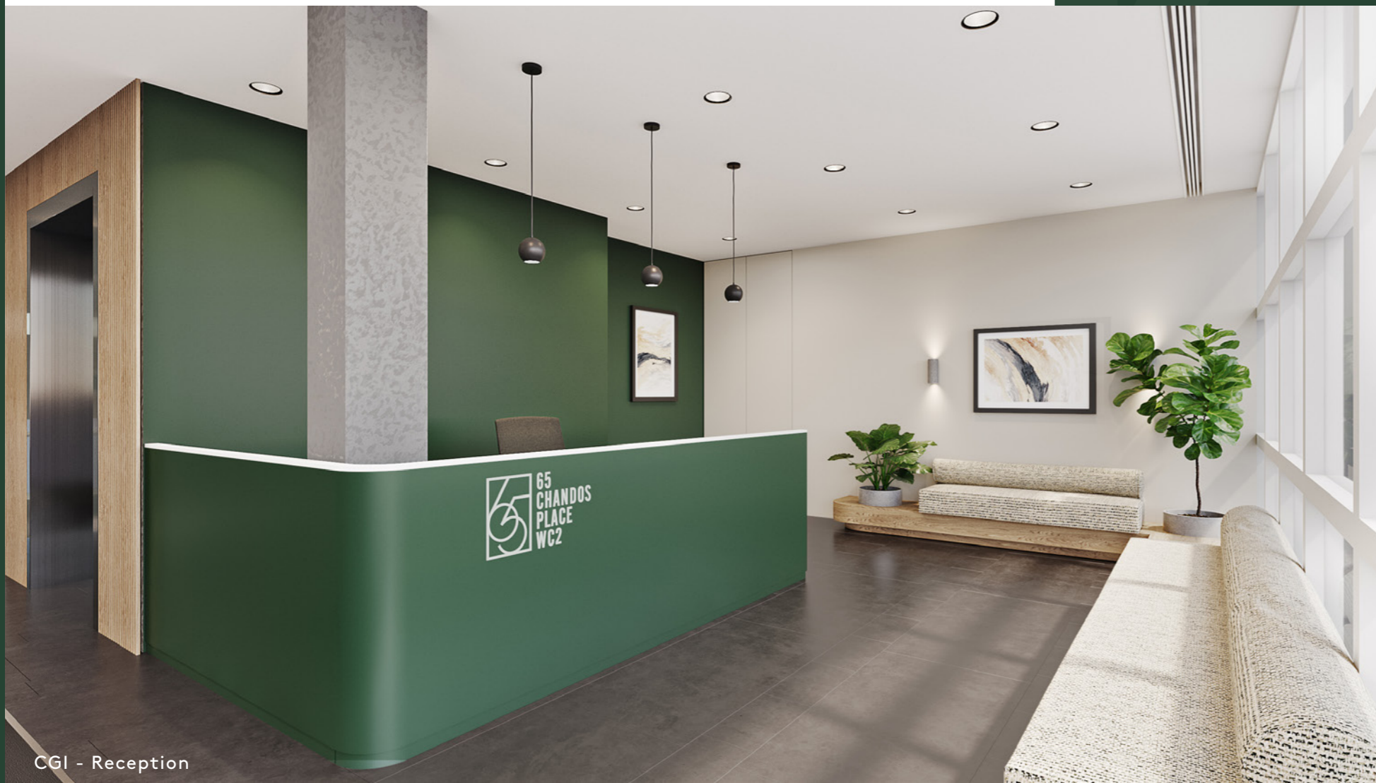
CGI - Reception