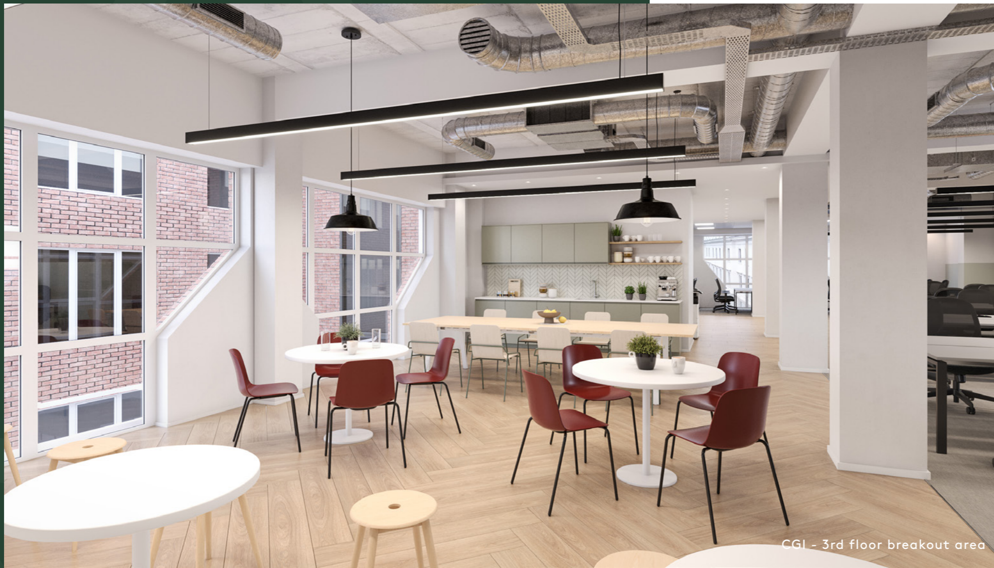
CGI - 3rd floor breakout area