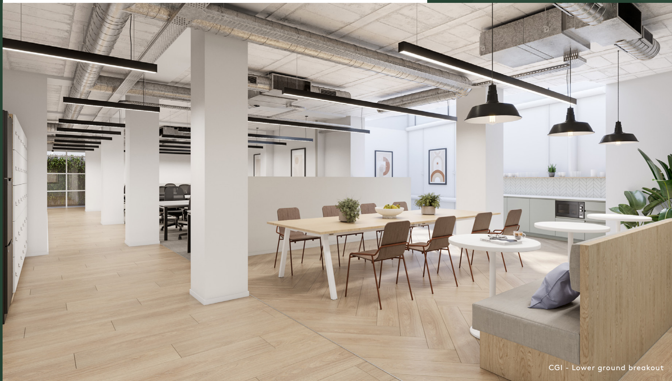
CGI - Lower ground breakout