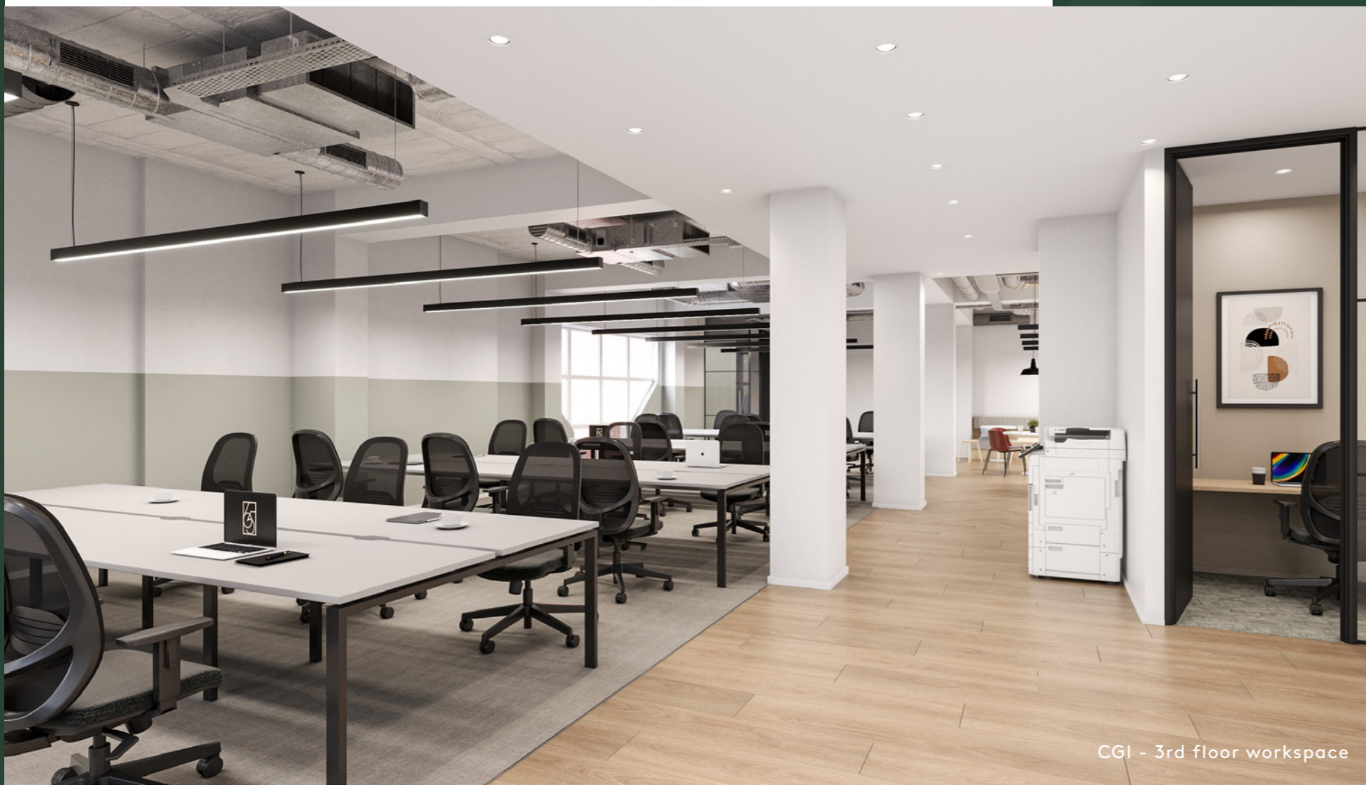
CGI - 3rd floor workspace