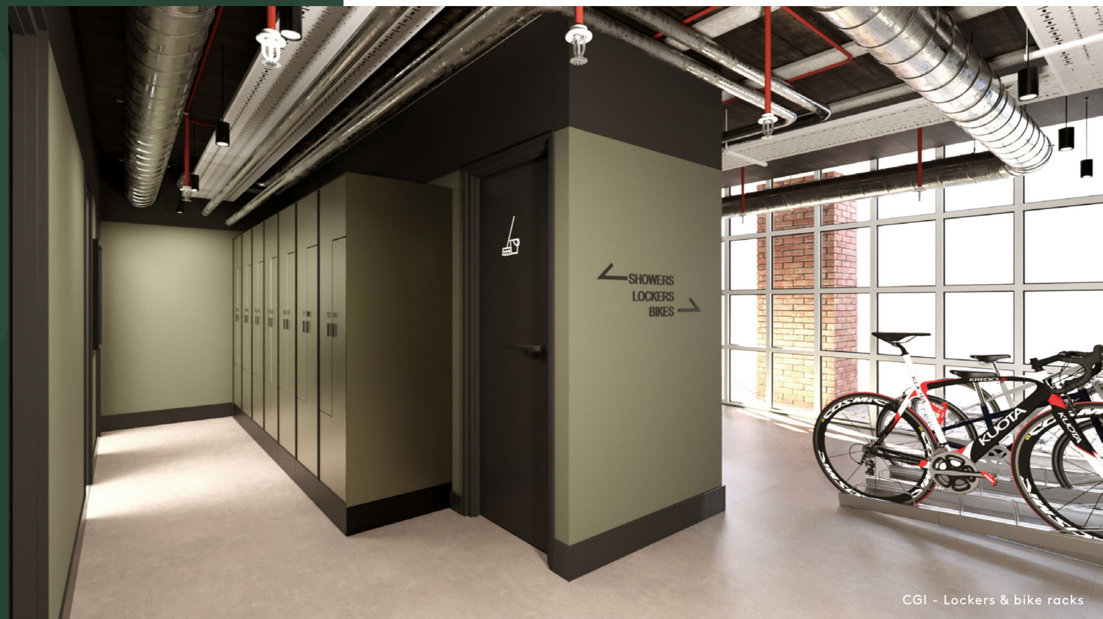
CGI - Lockers & bike racks