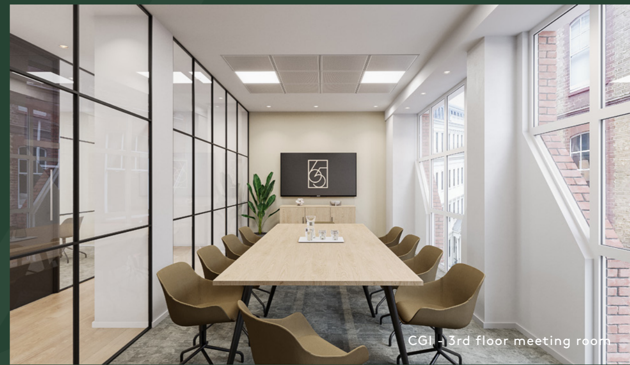
CGI - 3rd floor meeting room