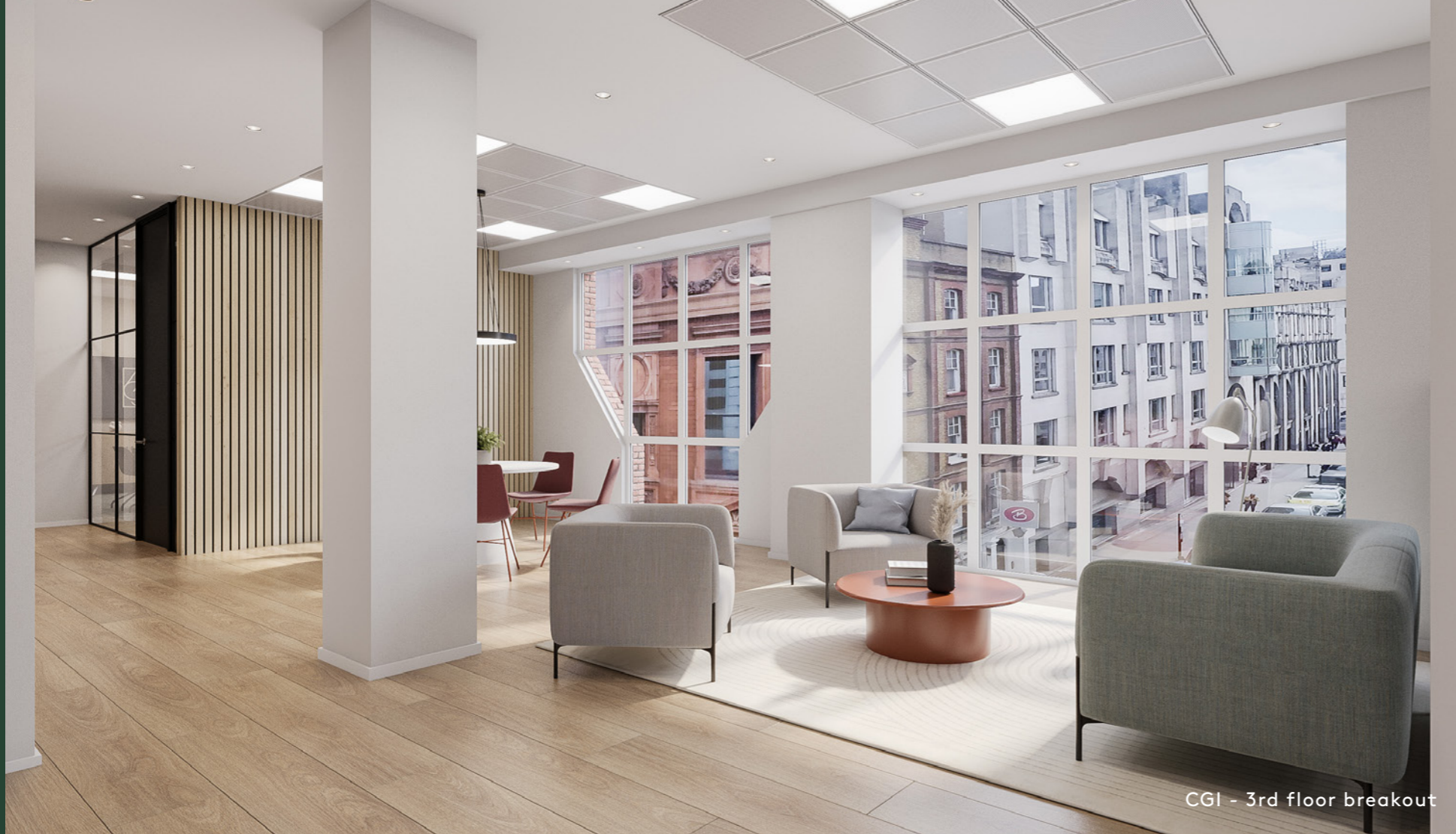
CGI - 3rd floor breakout