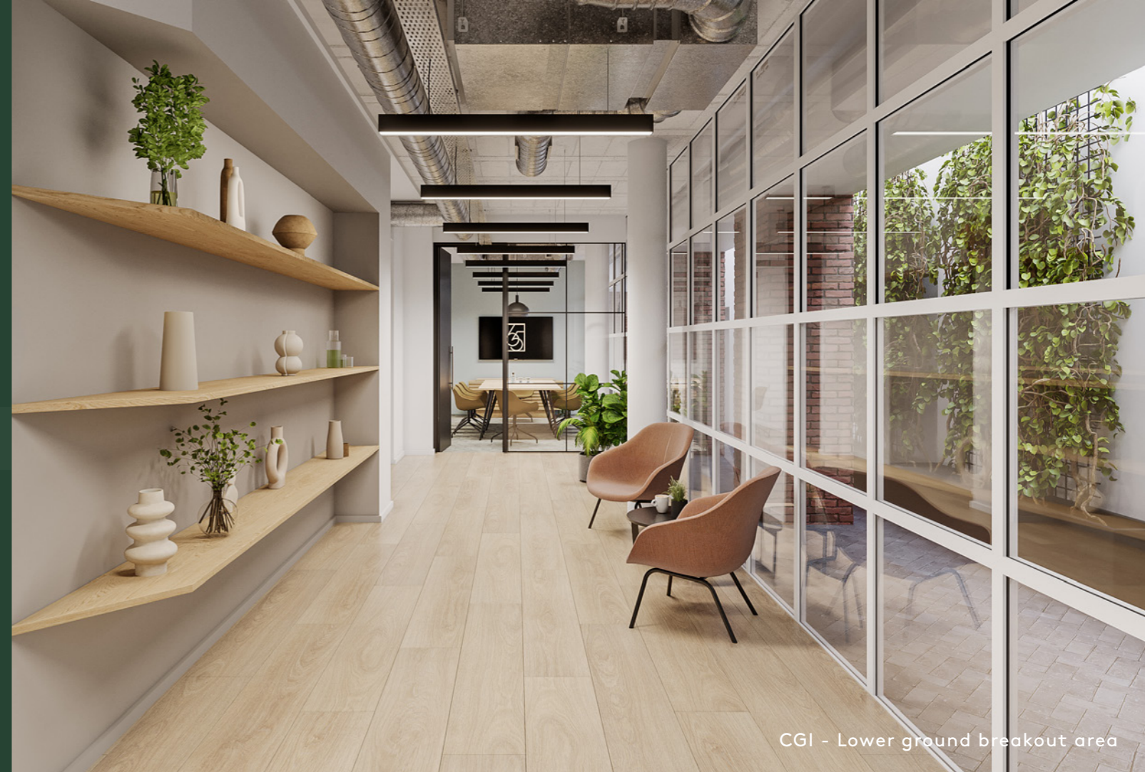
CGI - Lower ground breakout area